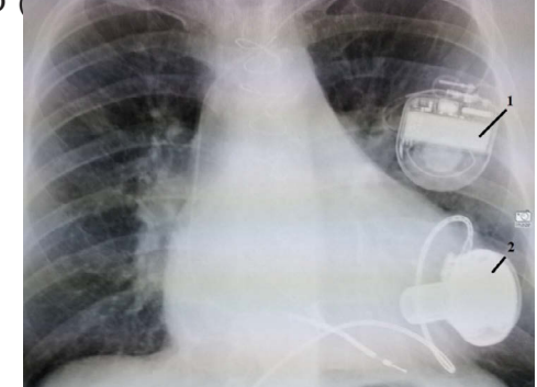
Fig. 2. Chest X-ray of patient P. with implanted LVAD device with centrifugal type and cardioverter-defibrillator. (Note: 1 – ICD, 2 – left ventricular support device (LVAD)).

Materials and methods. The subject of the study was 10 patients, males, 55 \pm 13.5 years old, with a body mass index of 30.8 \pm 8.3 m 2, with a left ventricular ejection fraction ranging from 9% to 28%, who had implant LVAD in the period from 11.03.2016 to 22.11 .2017 in the Silesian Center of the Heart Disease (Poland), in conditions of artificial blood circulation. In five of the patients who was examined, had been implanted of devices for resynchronizing therapy with defibrillator-function ICD (